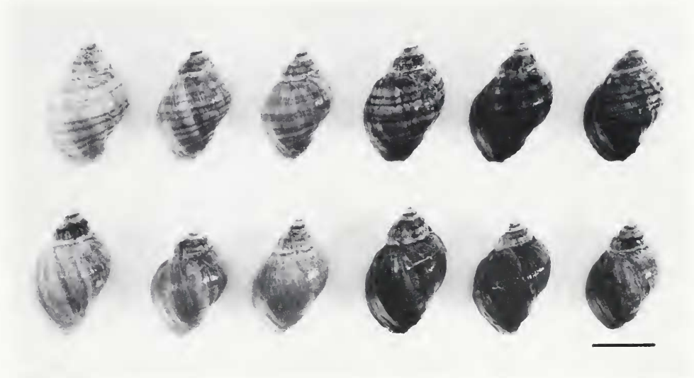
FIGURE 1. Shell banding dimorphism in Thais (or Nucella ) emarginata (Deshayes, 1839). Banding phenotypes from clutch 80-17-B2-MA (backcross of unbanded F1 female to original banded male parent; actual phenotype frequencies in Table I). The three left-most individuals in each row are predominantly orange, the three right-most, black. All snails in these clutches were raised from egg capsules deposited in the lab; only the three largest individuals of each phenotype combination were photographed. Approximate age of snails = 9 mos. Scale bar = 10 mm.

dominant allele causing outer shell pigment to be localized in spiral bands, and OB^U , a recessive allele resulting in uniformly pigmented shells.